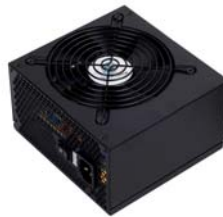
ST40F-ES Affordable quality 400W PSU