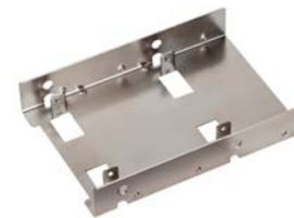
SDP08 Use SDP08 to convert an available 3.5" drive bay into two 2.5" drive bays