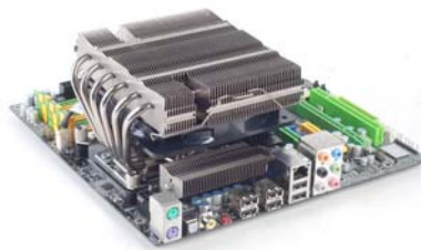
NT06-PRO Equip your PS08 with NT06-E for the ultimate combination of quietness and performance.