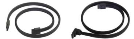
CP07+CP08 CP07 & CP08 SATA II cables are perfect for any regular SATA devices.