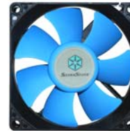
SST-SUSCOOL81 Equip your PS08 with Suscool 81 for the ultimate combination of quietness and performance.