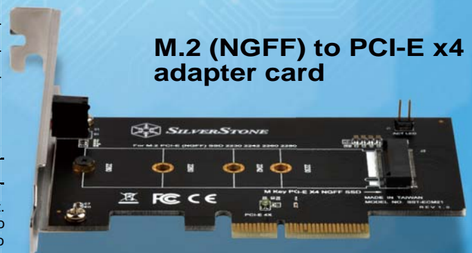
M.2 (NGFF) to PCI-E x4 adapter card

Note : M.2 PCIe-NVME mode SSD requires the use of Intel® 9 series (Z97 H97 Z170 X99) or higher version chipset motherboard with Windows 8 or higher version operating system.